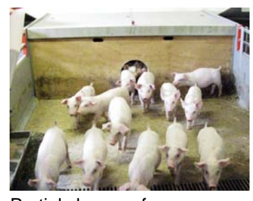
Partial closure of cover