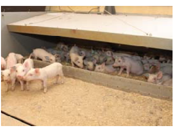
Improving thermal environment with straw board