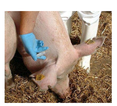
Injection in the neck muscle