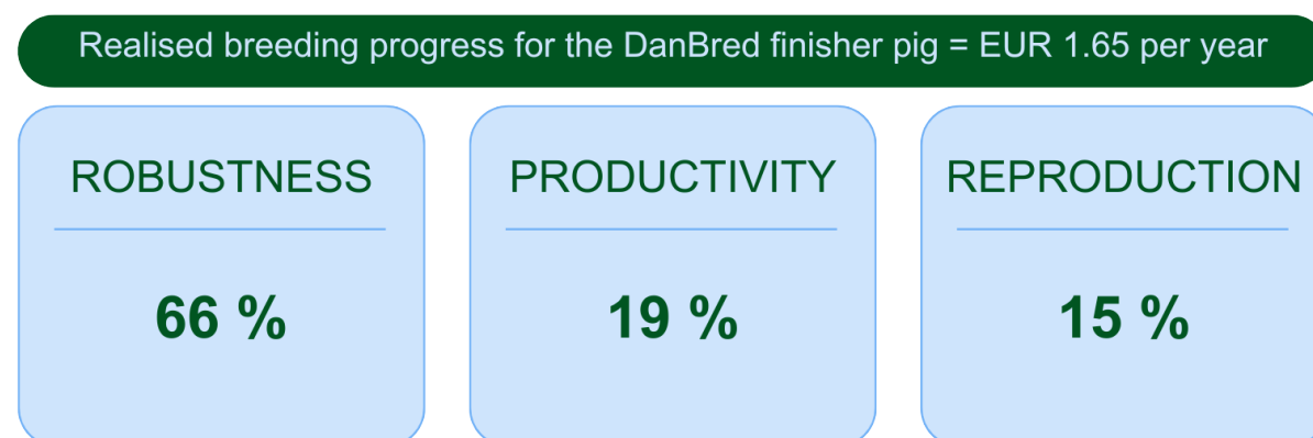
Figure 1. The realised breeding progress for the past two years has been DKK 12.30 / EUR 1.65 per year per DanBred finisher pig, but is presumed to be even higher, as the trait 'sow survival' cannot yet be included in the calculation. The expected breeding progress is divided into three categories: robustness (piglet survival and conformation), productivity (piglet and weaner growth, finisher growth, meat percentage, and slaughter loss) and reproduction (litter size).

In the past two years, the total breeding progress has been DKK 12.30 / EUR 1.65 per year per DanBred finisher pig. However, the actual total breeding progress is assumed to be even higher, since the trait 'sow survival' has not yet been included in the report. The reason is that the breeding progress for sow survival cannot yet be calculated accurately.