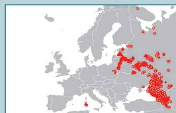
The European Commission and the OIE. ASF in wild boar and domestic pigs 2007 - 2016

The infection may be transmitted by feeding with raw slaughterhouse waste, meat or offal containing the virus or during animal transport. From the time that the disease is transmitted until signs of it become apparent in the pigs, usually up to 5 - 10 days have passed. The symptoms are similar compared to classical swine fever: high mortality, high fever, severe diarrhoea and red or bluish discoloration of the skin.