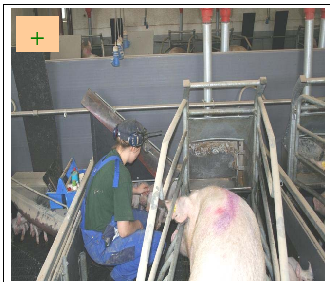
Staff member inspecting pigs in a farrowing pen