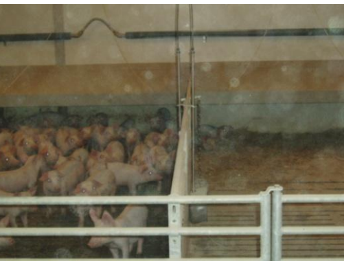
Uneven stocking density: Some pigs are cold, some too warm, others fine