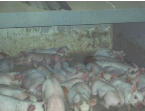
The pigs pull away from the cover: It is too warm