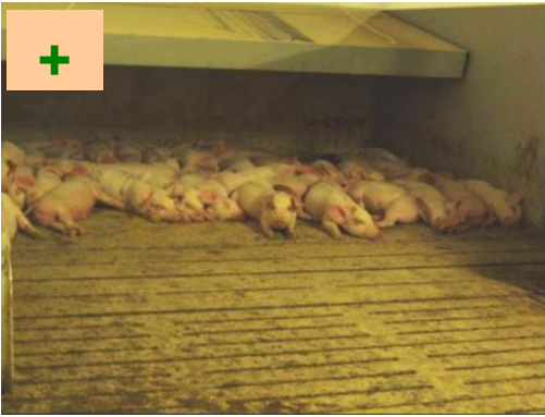
Correct lying behaviour. The temperature is right