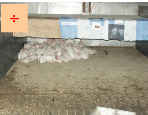
The pigs are huddling: It is too cold