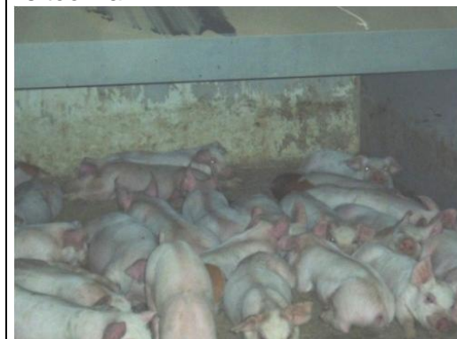
The pigs pull away from the cover: It is too warm