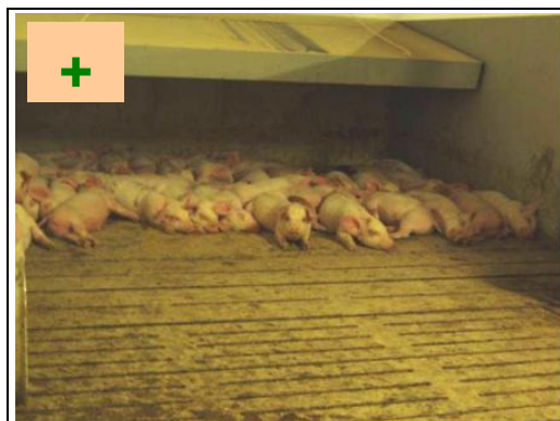
Correct lying behaviour. The temperature is right