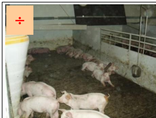
The pigs lie along the pen partition: It is too warm