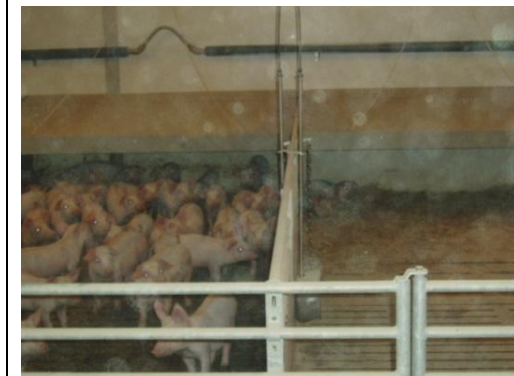
Uneven stocking density: Some pigs are cold, some too warm, others fine