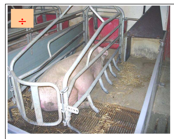
The heat lamp is missing and the board in front of the creep area is up